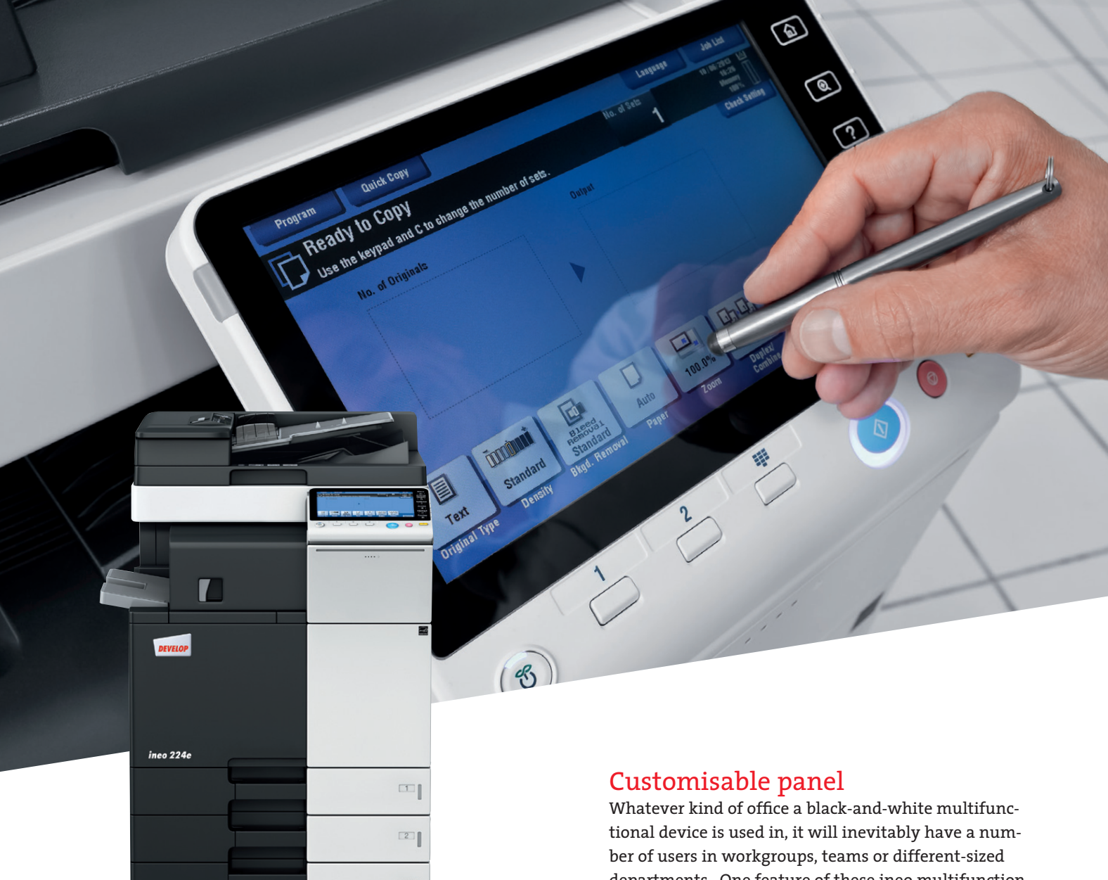
ineo 224e with document feeder (DF-624), inner finisher (FS-533) and large paper feeder (PC-410)